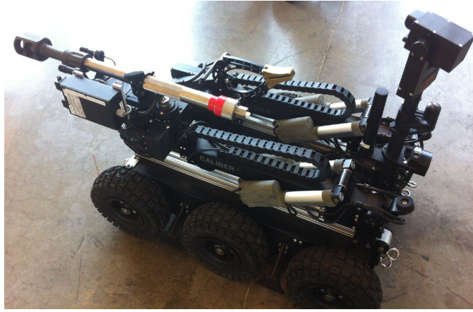
Explosive Ordnance Disposal Robot, Springfield (MO) Fire Department