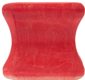
Ordnance (wooden block)